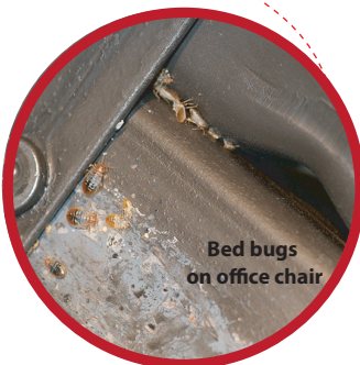
Bed bugs on office chair